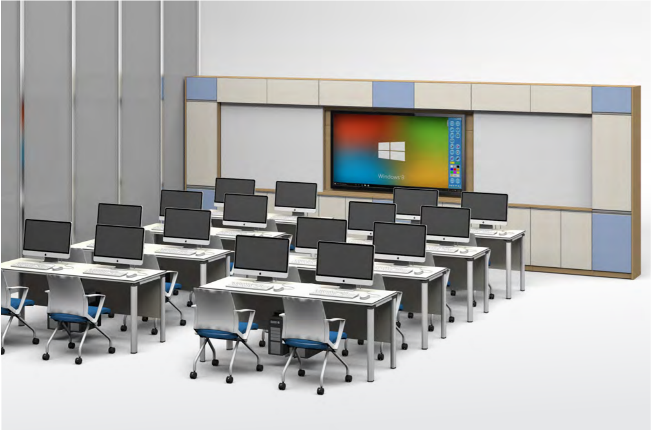
Various teaching tools and learning equipment can be stored using the interior effect of the blackboard wall, visual stability and storage space.